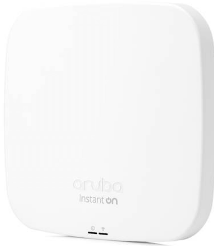
Aruba Instant On AP15 Indoor Access Points

Whether you own a design firm or a tech start up, your employees and customers are relying on the network for almost everything they do. And because Wi-Fi plays such a crucial role today, you need a purpose-built solution that keeps your business on the go. Aruba Instant On Access Points (APs) are easy to deploy and manage-with a quality look and feel at an attractive price point.